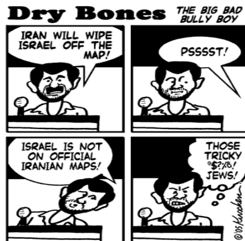
Courtesy of Yaakov Kirschen (10/28/2005) www.DryBonesBlog Blogspot.com

After British troops had tried unsuccessfully for two days to outgun Turkish troops, 800 Australians of the Light Horse Brigade, whose horses had not drunk in 48 hours, were ordered on Oct. 31, 1917 to charge into the firing line of 4,000 entrenched and heavily armed Turks and Germans. The brigade successfully captured the area.